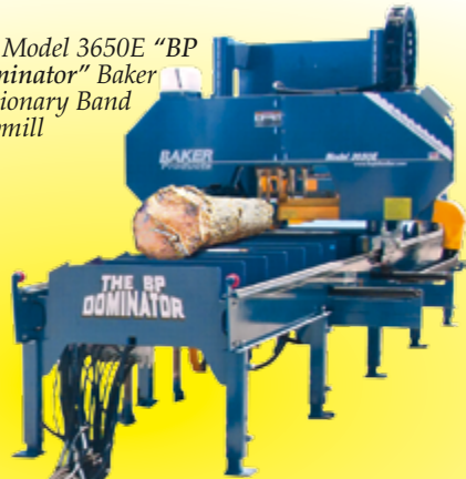
The Model 3650E "BP Dominator" Baker Stationary Band Sawmill

HEAVY-DUTY Frame Composed of Two Solid Steel I-Beams!