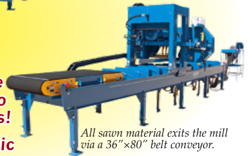
All sawn material exits the mill via a 36" x 80" belt conveyor.