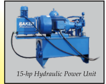
15-hp Hydraulic Power Unit